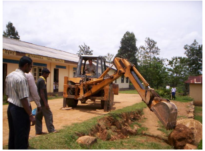
Landscaping for school playgrounds