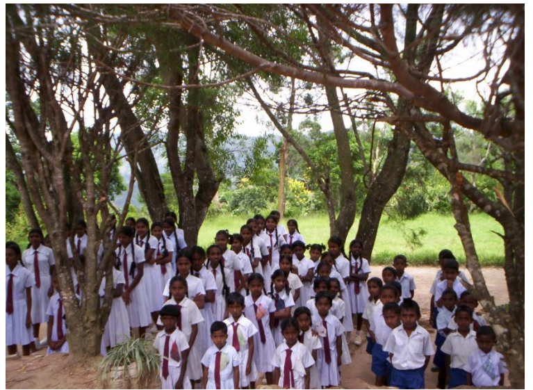
Supplying computers to several schools around the Ella District