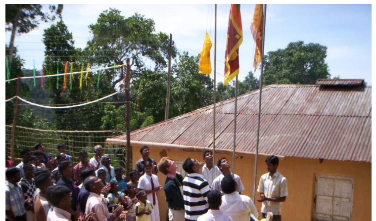
Refurbishing the Royal Newburgh Sports Club