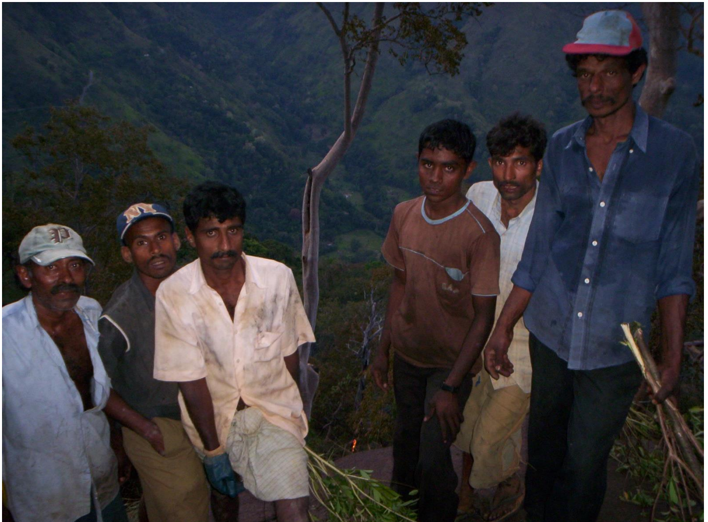
Our men working hard to put a fire out in the forest below Ravana waterfall