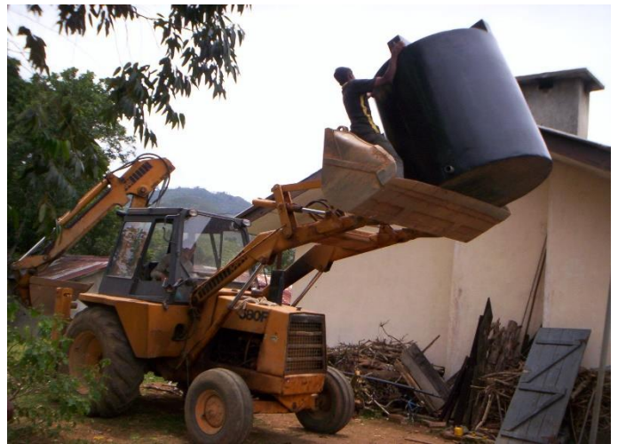
Digging and installing a water well, pump, pipeline and tank system for a local Primary school