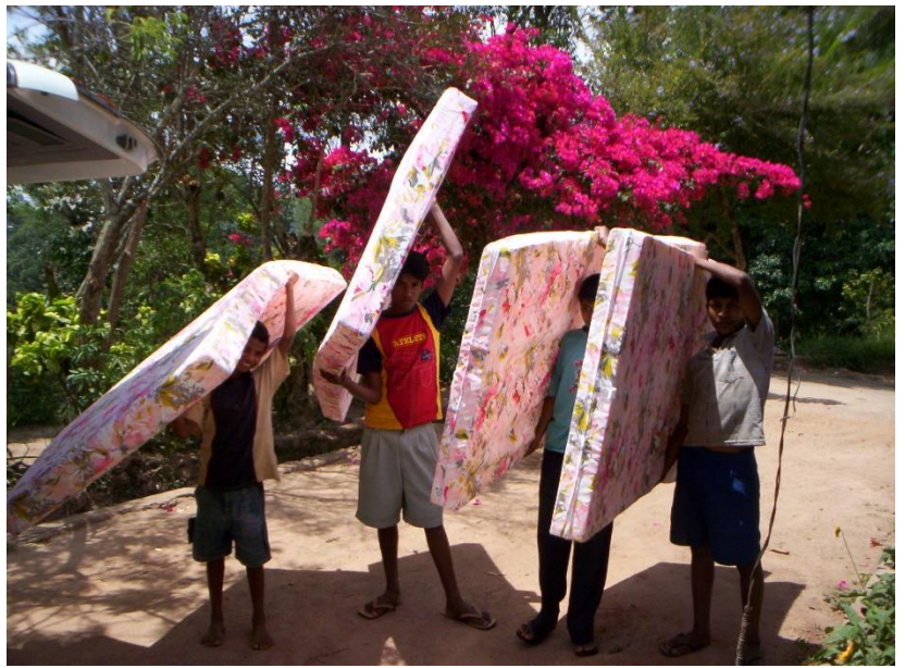
Painting a local orphanage and supplying new mattresses to an orphanage near Bandarawela