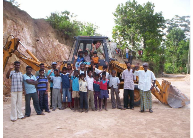
Building a Volleyball court for our local community in Newburgh